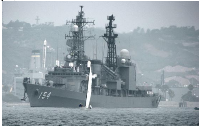
Boat in foreground is a Lightning. Maybe we shouldn't complain about our powerboat problems. (JA)

shipping channel and over our heads. Destroyers, aircraft carriers, battleships, zodiacs with arms, fighter jets, and even a submarine or two were seen often.