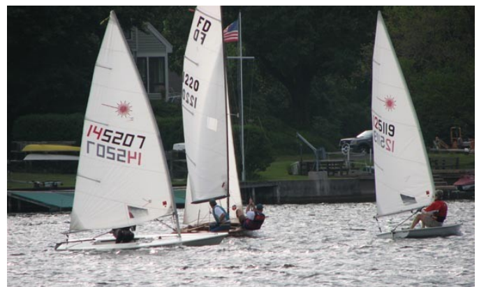
TNS Handicap Fleet action

The Thursday Night Sailing series ended with a surprise encore sailing night on August 31. The encore night came about by a "show of hands" at the picnic on August 24. The turnout on that encore night was tremendous with 10 Lightnings, 2 Snipes, 2 Lasers and 1 cruiser (Flying Dutchman). This tied the largest turnout of 15 on June 15. The sailing on August 31 was just for fun and I think everyone had fun sailing and picnicking after the racing.